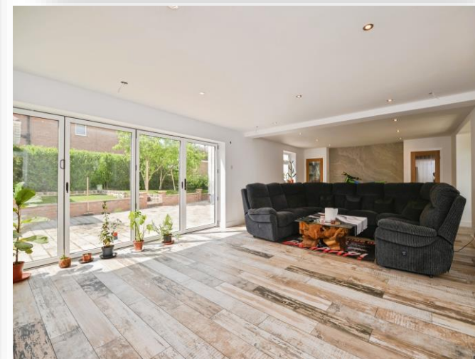
The Green, Thornaby Stockton-On-Tees TS17 0AH