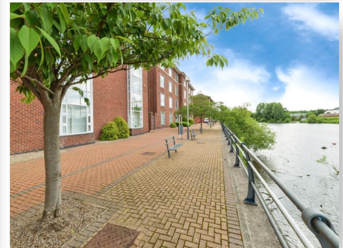
Clifton House Thornaby Place, Thornaby Stockton-On-Tees TS17 6SD