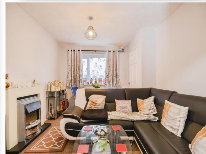
Richard Hind Walk, Stockton-On-Tees TS18 3LU