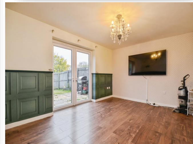
Kingfisher Avenue, Stockton-On-Tees TS20 2FA