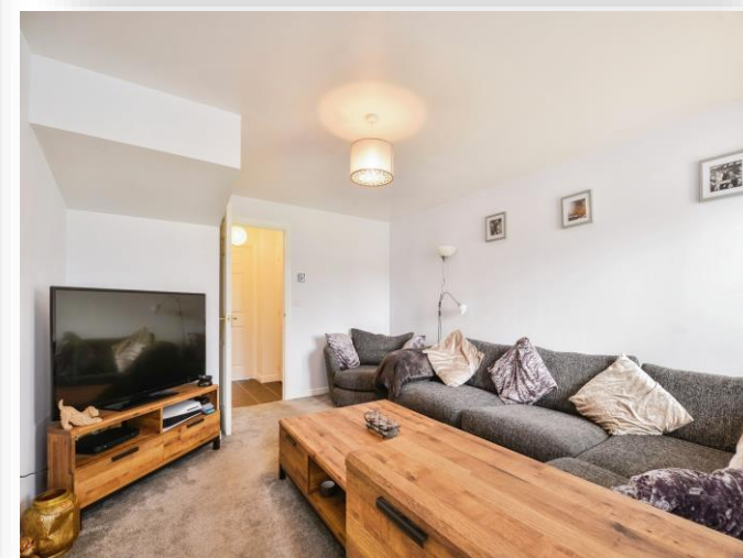
Greatham Avenue, Stockton-On-Tees TS18 2QB