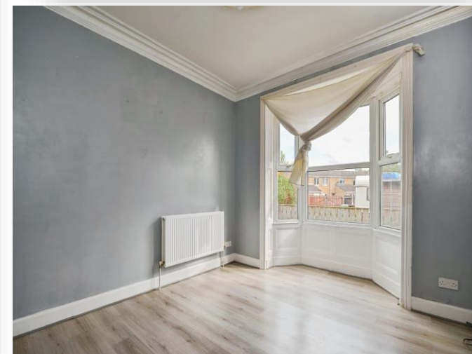
Derby Terrace, Thornaby Stockton-On-Tees TS17 7EL