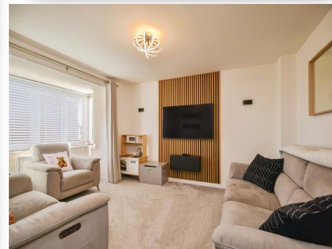
Furrow Close, Stockton-On-Tees TS19 8GS