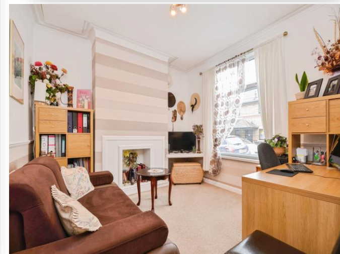
Wycombe Street, Darlington DL3 7DA