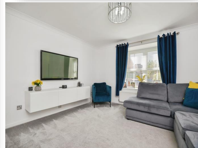
Harlech Court, Ingleby Barwick Stockton-On-Tees TS17 5DR