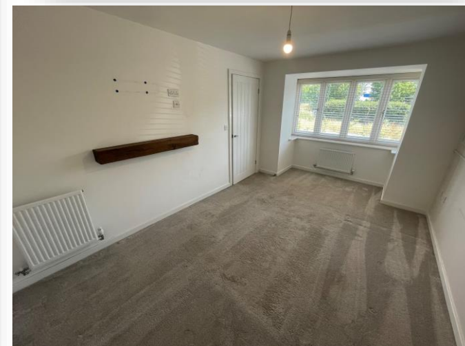
Plough Crescent, Stockton-On-Tees TS19 8GZ