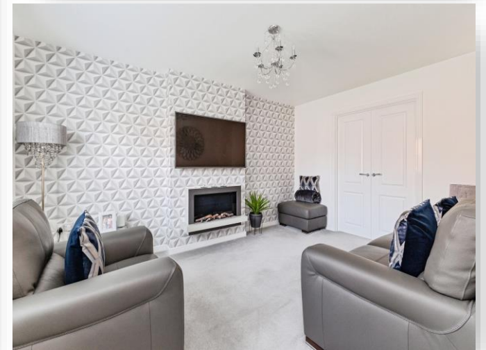
Sculptor Crescent, Stockton-On-Tees TS18 3WD