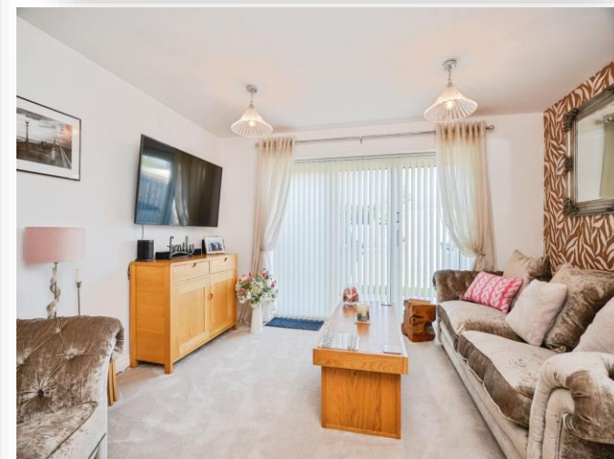
Casson Gardens, Thornaby Stockton-On-Tees TS17 0FU