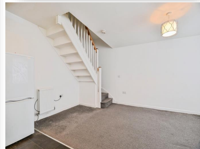
Bourneville Drive, Stockton-On-Tees TS19 8LD