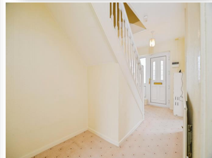
Rothbury Avenue, Stockton-On-Tees TS19 9JG