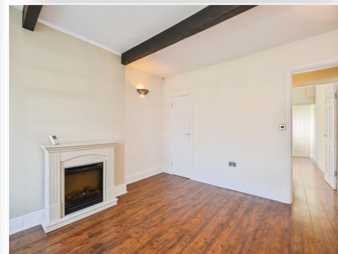
Hartburn Village, Stockton-On-Tees TS18 5DY