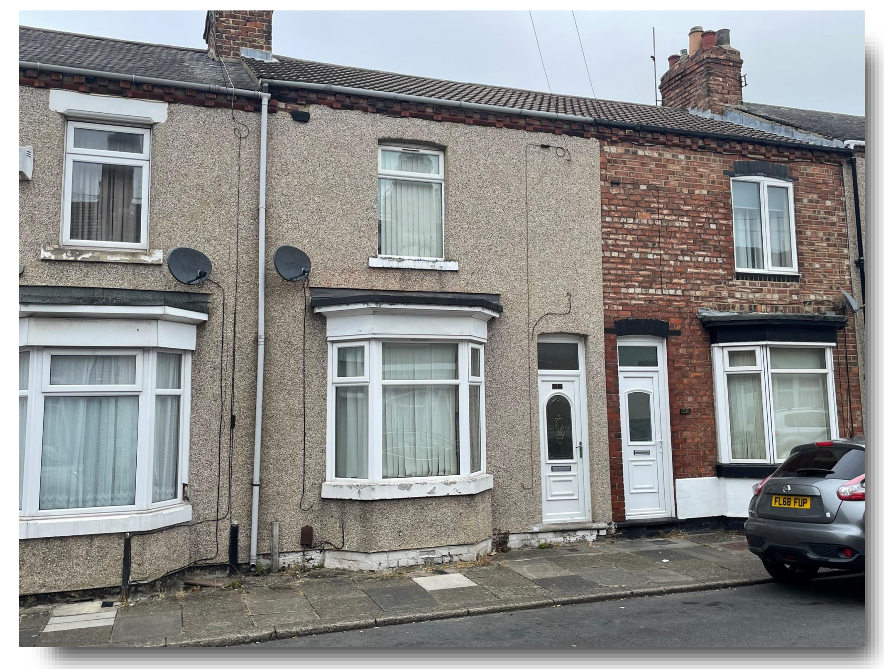
Camelon Street, Thornaby Stockton-On-Tees TS17 7HU