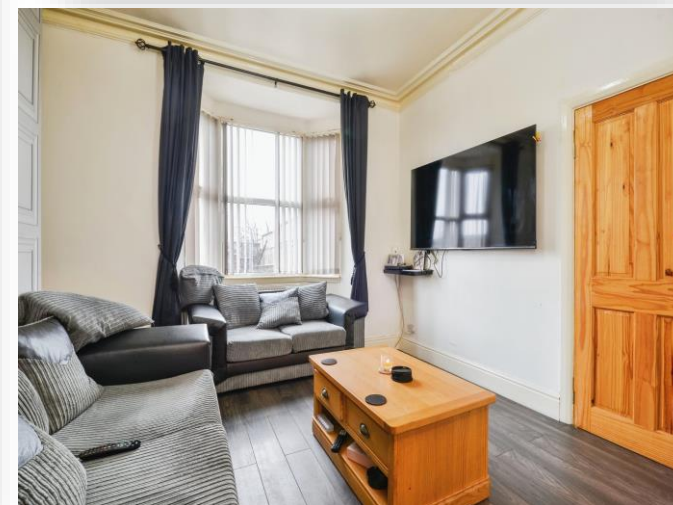
Derby Terrace, Thornaby Stockton-On-Tees TS17 7EL