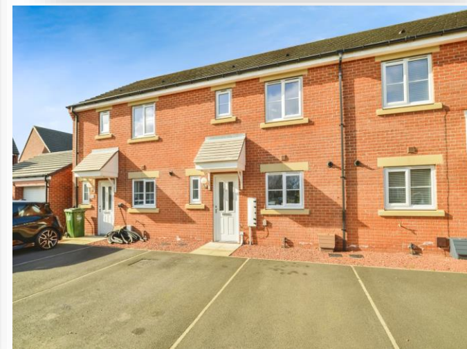
Sculptor Crescent, Stockton-On-Tees TS18 3WD