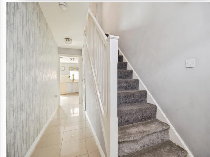
Elkington Close, Thornaby Stockton-On-Tees TS17 0FZ