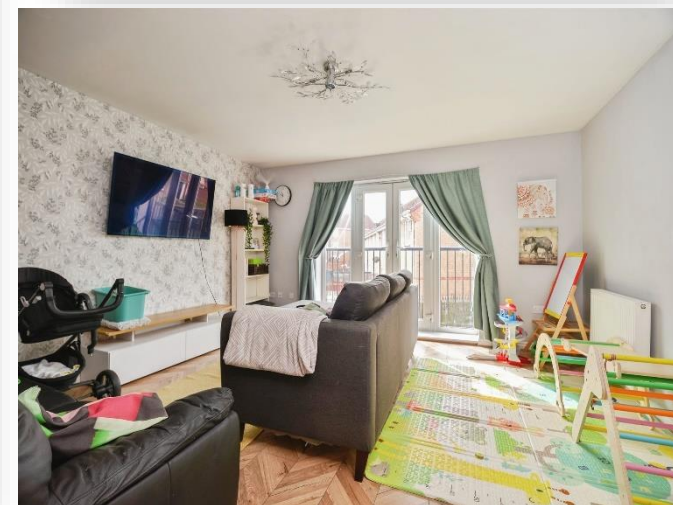
Elkington Close,Thornaby Stockton-On-Tees TS17 0FZ