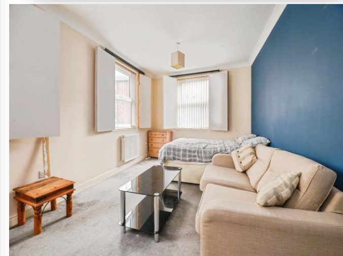
Chapman Street, Stockton-On-Tees TS20 1AP