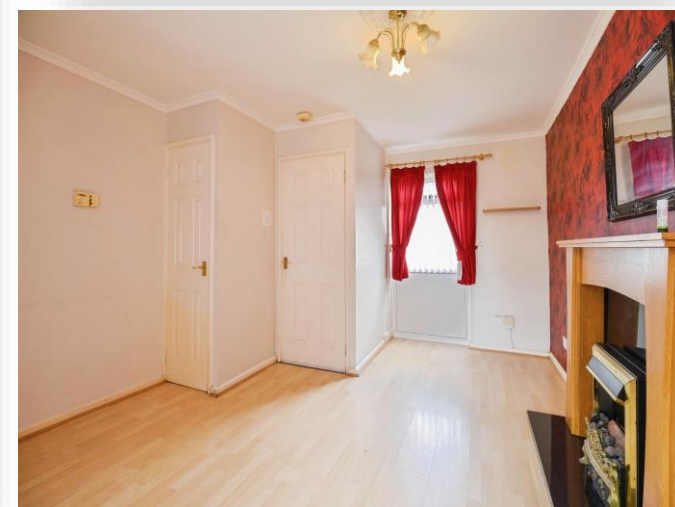
Parkfield Way, Stockton-On-Tees TS18 3SU