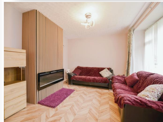
Rudyard Avenue, Stockton-On-Tees TS19 9LQ