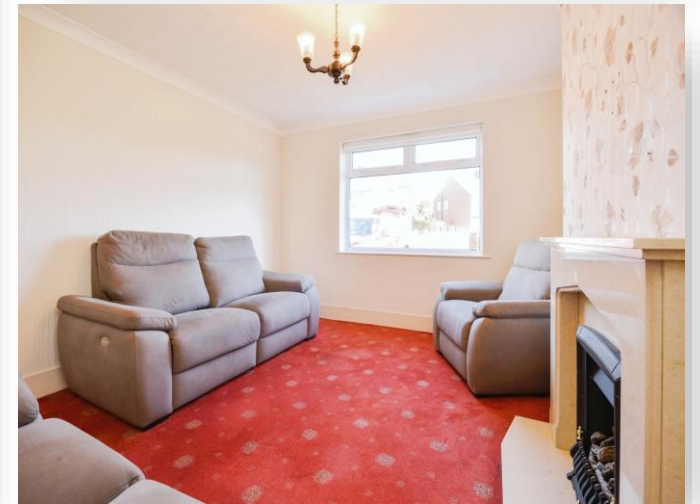
Park Crescent, Stillington Stockton-On-Tees TS21 1JF