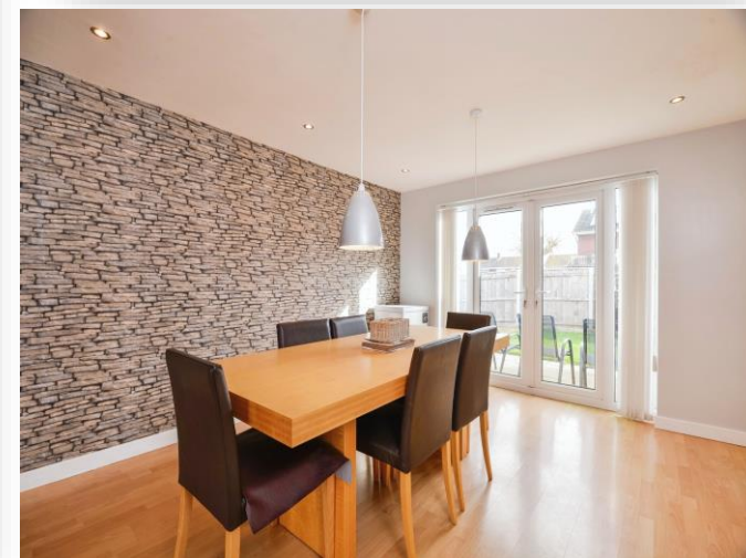
Helston Court, Thornaby Stockton-On-Tees TS17 9QE