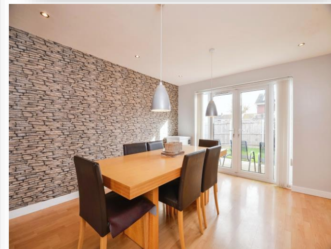
Helston Court, Thornaby Stockton-On-Tees TS17 9QE