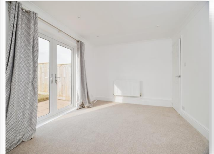
Hedley Close, Yarm TS15 9UA