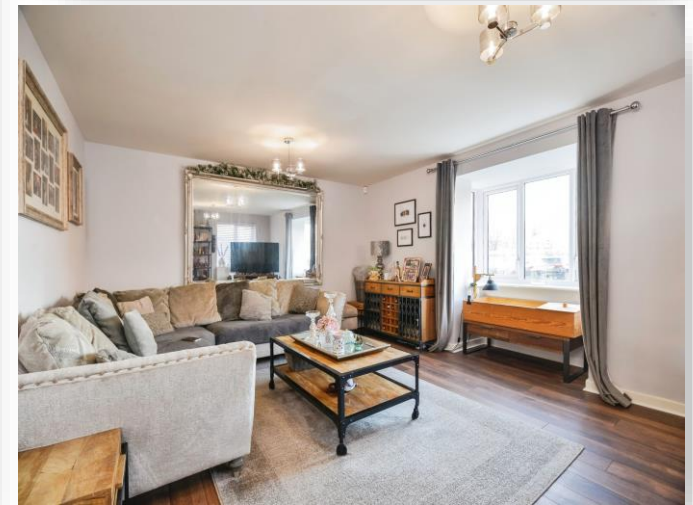
Edenwood Close, Stockton-On-Tees TS18 2FS