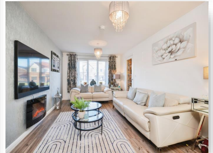
Lorimer Close, Sedgefield Stockton-On-Tees TS21 2BP