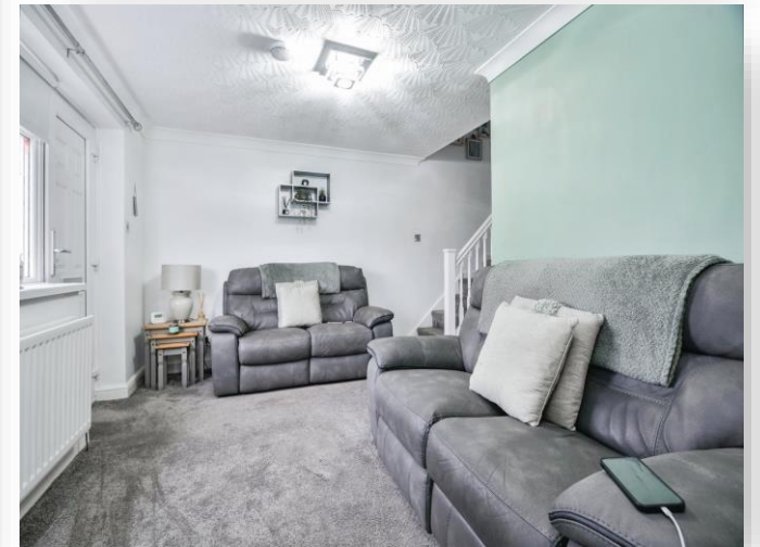
Hickling Grove, Stockton-On-Tees TS19 0XA