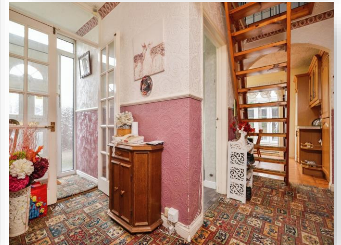
Park Drive, Stockton-On-Tees TS19 8AB