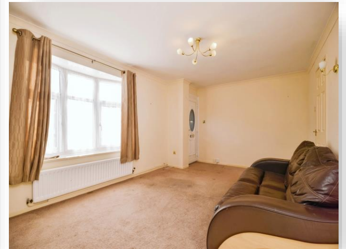
Markham Square, Stockton-On-Tees TS19 0TE