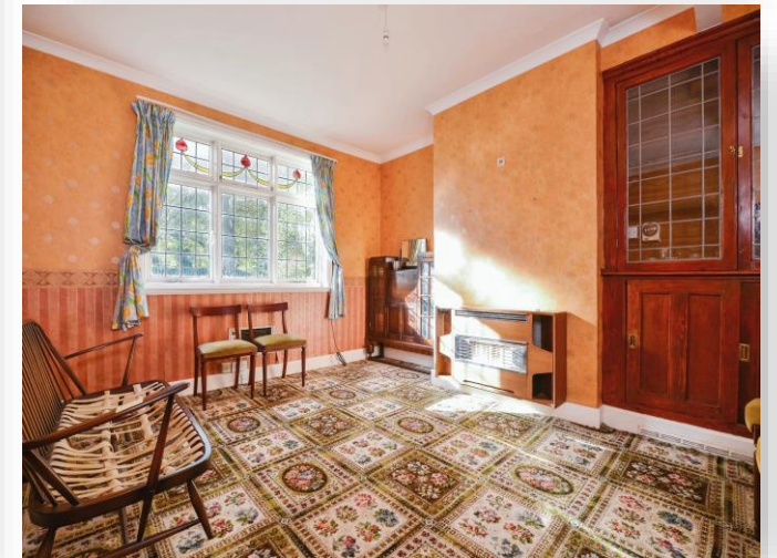
Balmoral Terrace, Stockton-On-Tees TS18 4DD