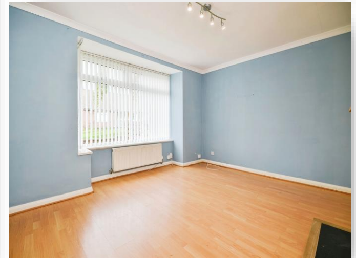
Inskip Walk, Stockton-On-Tees TS19 8EF