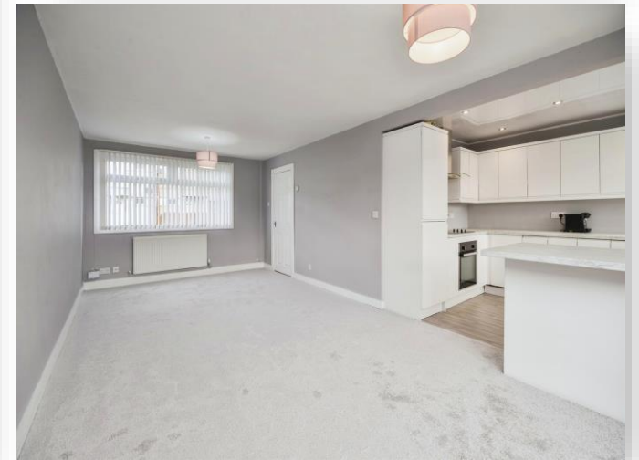
Cowpen Crescent, Stockton-On-Tees TS19 8QB