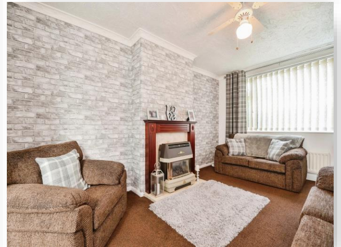
Rothbury Avenue, Stockton-On-Tees TS19 9HG