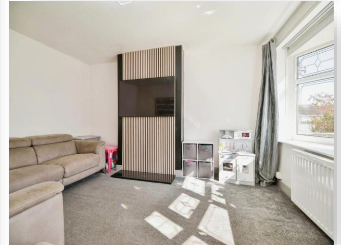
Thorn Road, Stockton-On-Tees TS19 0NN