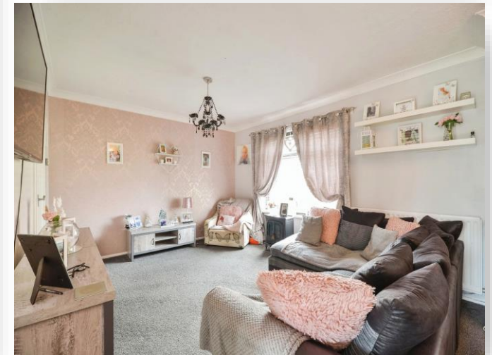
Markham Square, Stockton-On-Tees TS19 0TE