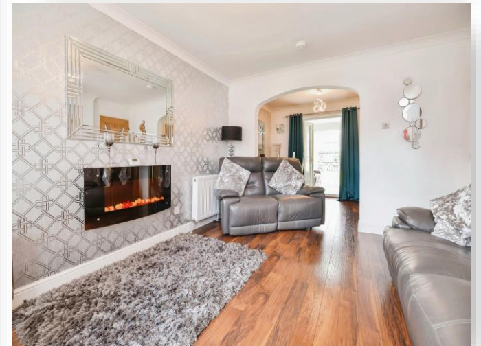
Holburn Park, Stockton-On-Tees TS19 8BJ