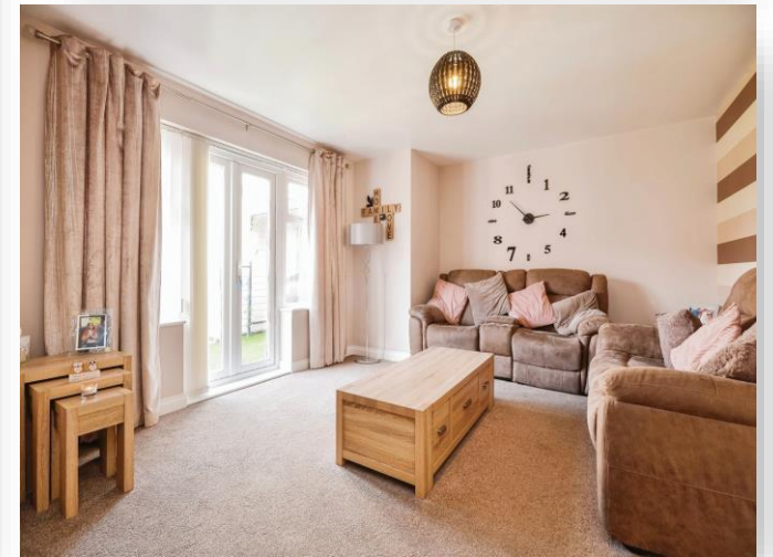
Hope Gardens, Stockton-On-Tees TS18 3BY