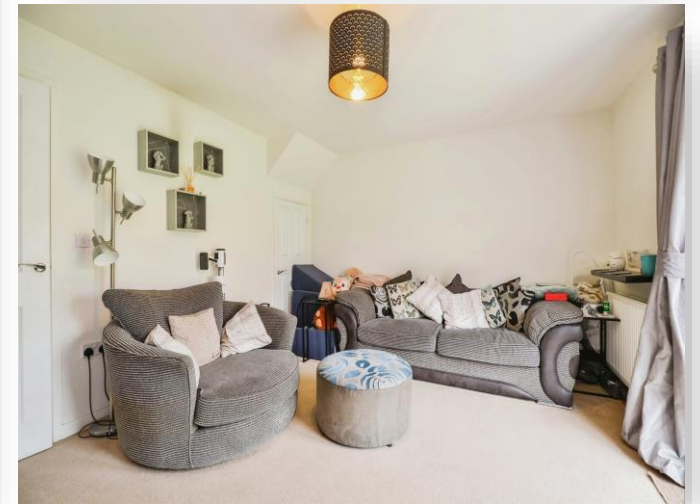
Port Sunlight Grove, Stockton-On-Tees TS19 8LE