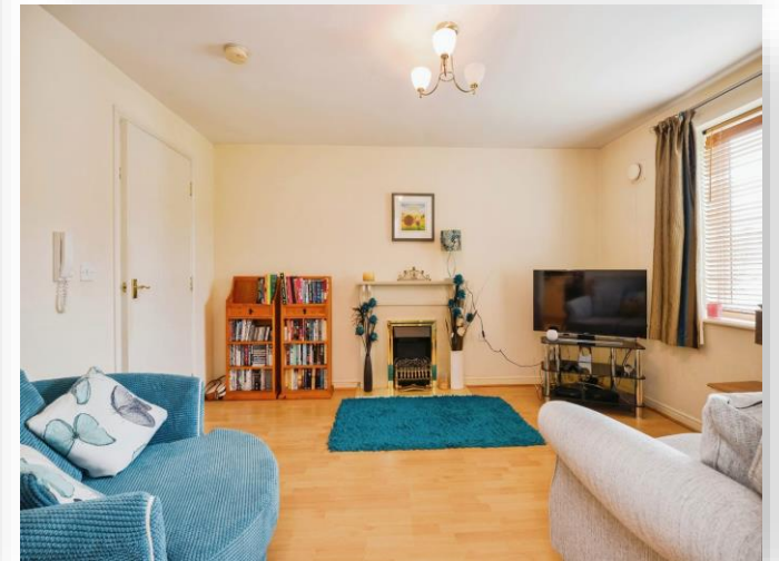
Mill Meadow Court, Stockton-On-Tees TS20 2GA