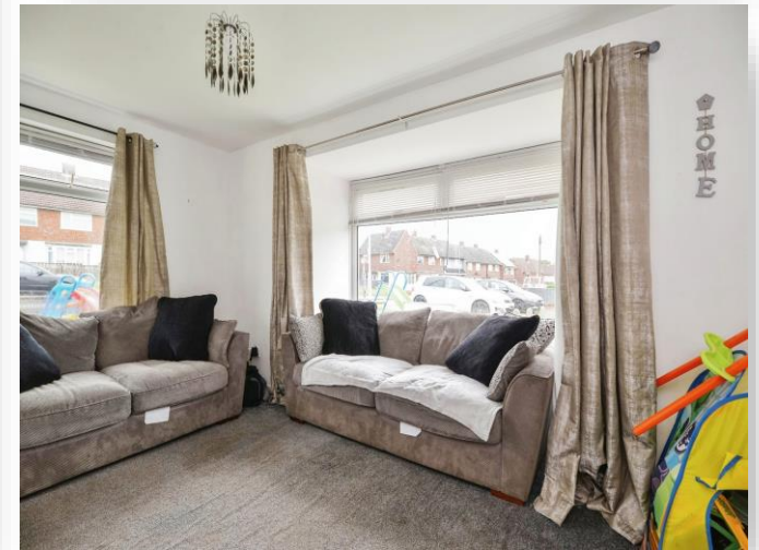
Scurfield Road, Stockton-On-Tees TS19 8RR