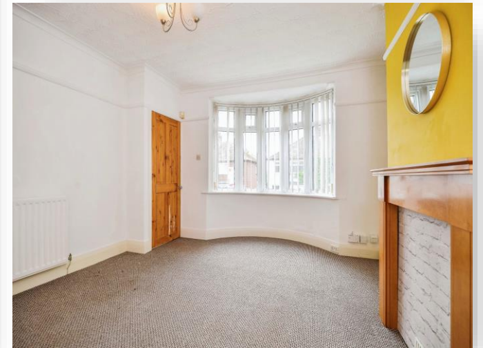
Brentford Road, Stockton-On-Tees TS20 2DW