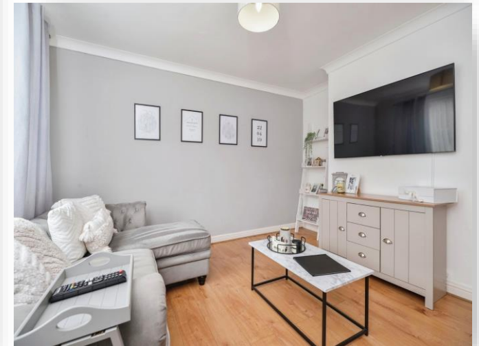
Belvedere Road, Thornaby Stockton-On-Tees TS17 7JH