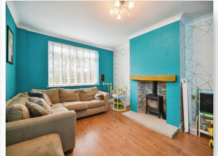
Beech Oval, Sedgefield STOCKTON-ON-TEES TS21 3DL