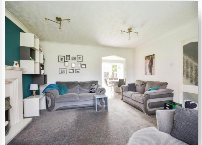
Roecliffe Grove, Stockton-On-Tees TS19 8JU