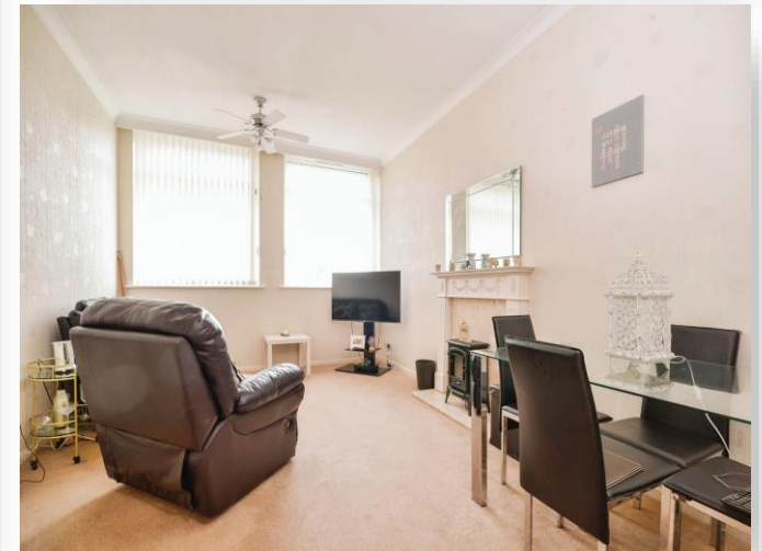
Daylight Bakery House Daylight Road, Stockton-On-Tees TS19 OSR