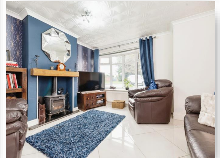
Maria Drive, Stockton-On-Tees TS19 7JN