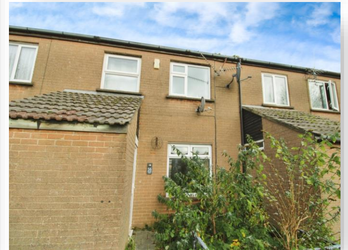
Rutland Street, CARDIFF CF11 6TD